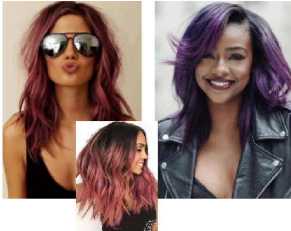
Video #2 (Universal application, Red)

Need model with red hair; any shade of red will do