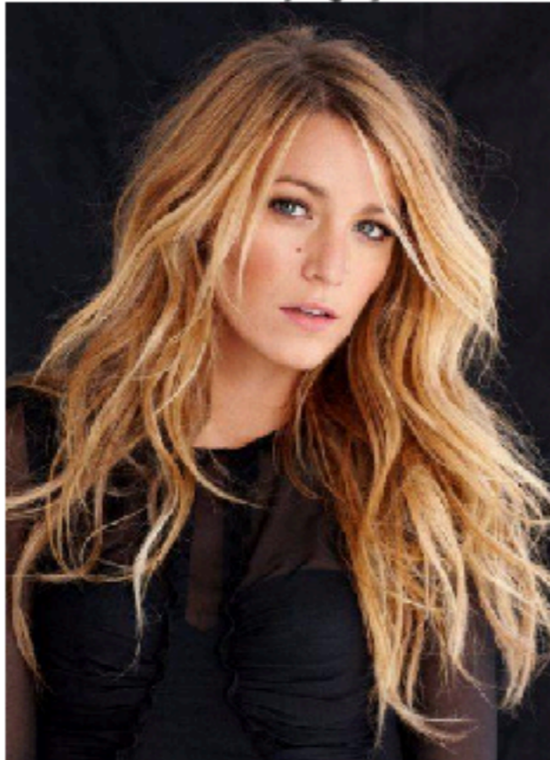
Video #1 (Perfect golden Balayage)